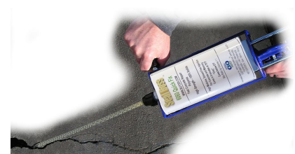
SealBoss® QuickFix Crack Repair