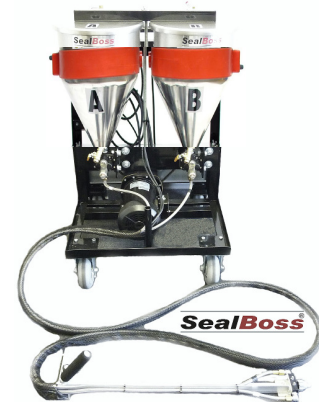
JointMaster Pro2 with Heater Band Option

For detailed information please refer to the Product Data Sheets, MSDS and SealBoss.com website. Your Sealboss Technical Representative will gladly assist you with any further questions you may have.