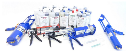
SealBoss® QuickFix Cartridge System