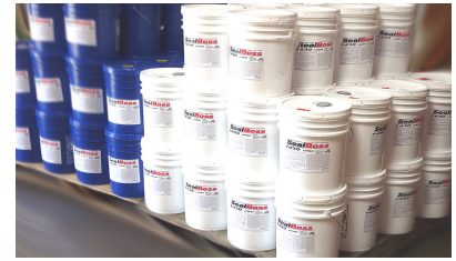
SealBoss® QuickFix System Bulk

For detailed information please refer to the Product Data Sheets, MSDS and SealBoss.com website. Your Sealboss Technical Representative will gladly assist you with any further questions you may have.