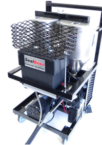
JointMaster Pro1 with Battery Pack Option