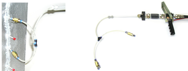
Applicator with Static-Mixer & Split-Set (optional)

The tanks are unitized and mounted on four easy roll caster wheels with breaks. The machine is very mobile. The pump is available in 2:1 or 1:1 mixing ratio versions. With purchase of a separate piston/cylinder unit mixing ratios can be easily interchanged. This machine is not designed for paste and putty materials that do not flow. Please call our sales office for specific information in regards to materials and temperature ranges.