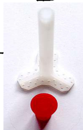
Epoxy Surface Port