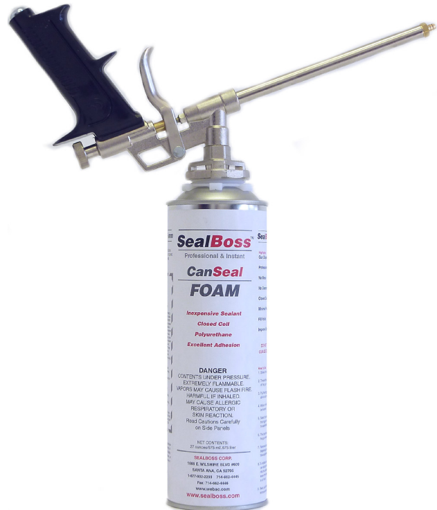
Store Like This

Instant One Component Closed-Cell Polyurethane Foam up to 8 Gal Foam From 27oz Can