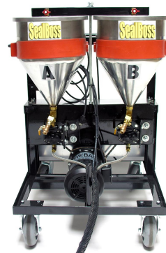
Shown with optional Heater Bands

Please contact a representative for detailed information and limitations. Specific product sheet data and MSDS of product to be intended for use will help you to determine the suitability.